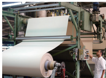
Manufacturing & Logistics