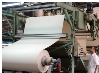
Manufacturing & HDMI