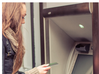
POS, Food & Beverage