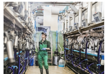
Farming & Agriculture