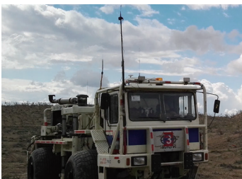
Vehicle Mounted: Truck, Forklift & Trash Collection