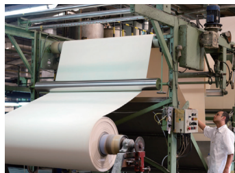
Manufacturing & Logistics